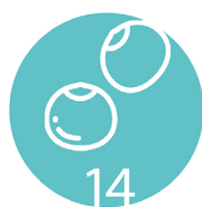
ΛΟΥΠΙΝΟ | LUPIN