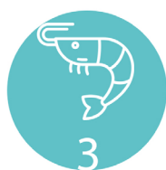
ΘΑΛΑΣΣΙΝΑ ΜΕ ΚΕΛΥΦΟΣ CRUSTACEANS