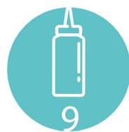
ΜΟΥΣΤΑΡΔΑ | MUSTARD