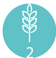
ΣΙΤΗΡΑ ΜΕ ΓΛΟΥΤΕΝΗ CEREALS INCLUDING GLUTEN