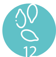
ΣΠΟΡΟΙ ΣΟΥΣΑΜΙΟΥ SESAME SEEDS