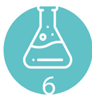
ΔΙΟΞΥΔΙΟ ΤΟ ΘΕΙΟΥ SULPHUR DIOXIDE