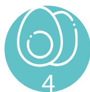
ΑΥΓΟ | EGG