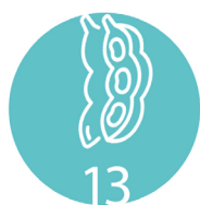
ΣΟΦΙΑ | SOY BEANS