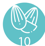
ΞΗΡΟΙ ΚΑΡΠΟΙ ΜΕ ΚΕΛΥΦΟΣ TREE NUTS