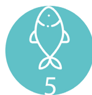
ΨΑΡΙ | FISH