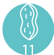
ΦΥΣΤΙΚΙΑ | PEANUTS