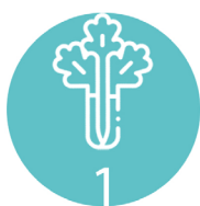
ΣΕΛΛΙΝΟ | CELERY