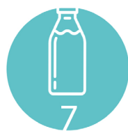
ΓΑΛΑ | MILK